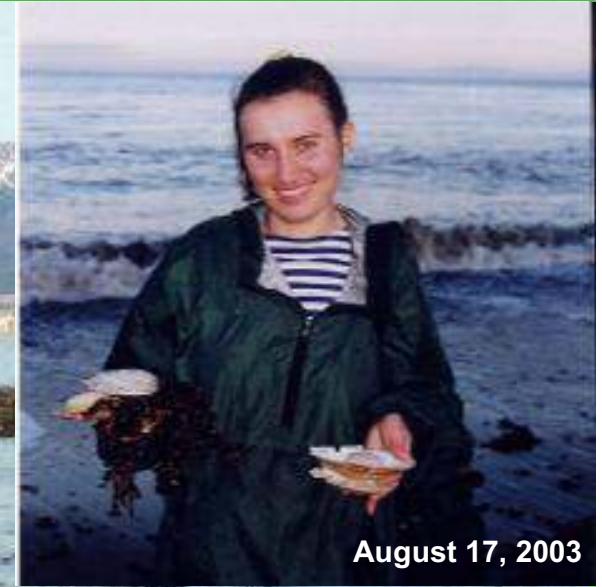
August 17, 2003

Remaining volume of dredging is about 2,000,000 m 3 What will be with our remaining resources in Aniva bay, when it will be dumped during next few months?