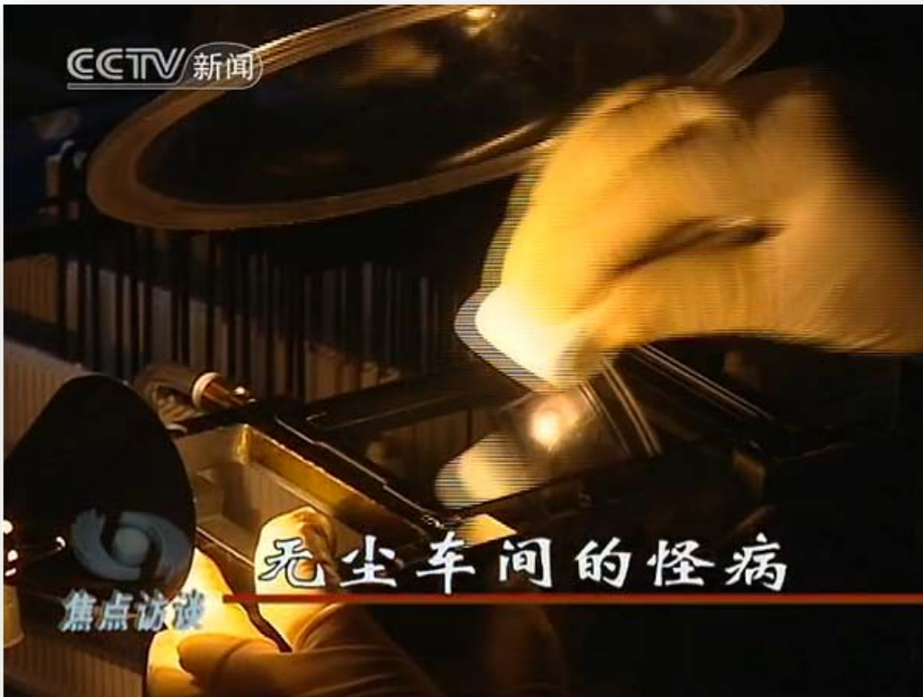
Figure 1 CCTV's "Focus Interview": The Clean Workshop's Strange Disease, CCTV, February 21nd, 2010

Although all 29 companies responded, the difference in the quality of their responses is remarkable. Hewlett Packard, British Telecom, Sharp, Samsung, and Toshiba, amongst others all had positive attitudes and expectations for improvements in the environmental management of their supply chains. Some companies that made communications or even commitments had limited action towards practical implementation of such commitments. Meanwhile, Apple, Sony, Nokia, LG, Ericsson and Sing Tel all performed negatively and there were expectations that there would be difficulties for them to make progress in mending the gaps in their supply chain management. The environmental NGO Coalition will continue to mobilize consumers and encourage them to take 'Green Choice Consumer Action' in order to push companies who are inactive to make steps to improve