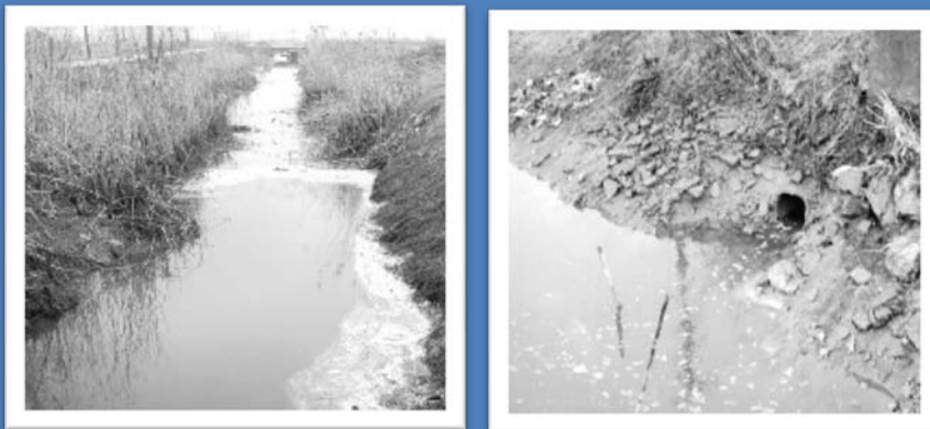
Image 3: Company secretly discharging blue pollution into the surrounding 'Jiu zhaigou' 28/02/2008

In the afternoon of February 25th, according to calls providing clues, the reporter asked the Municipal Environmental Protection Bureau personnel to go to the location of Changzhou Hongdu Electronics Co., Ltd, at the Weicun and Changjiang Village, Chunjiang Town. At this point, it was only to see a small river that lay outside the plant boundary walls and the obvious light blue colour that appears in the water. The trees on the two riverbanks, along with the surrounding grass was already withered and yellow and on the surface of the river a layer of white dust and other waste floats by. The villagers said they had informed the relevant department many times, but the water in the river is still blue.